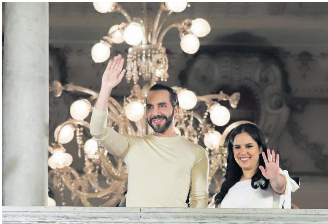
El Salvador President Nayib Bukele, left, accompanied by his wife Gabriela Rodriguez, wave to supporters from the balcony of the presidential palace in San Salvador, El Salvador, after polls closed for general elections on Sunday, Feb. 4, 2024.

The announcement comes after a painstaking vote counting process, which has raised the hackles of electoral watchdogs and the country's weak opposition, who cite irregularities. Bukele handily won re-election Feb. 4 with 84.7% of the vote. What had remained up in the air was if Bukele's New Ideas party would be equally as successful in legislative elections. On Monday, officials announced that New Ideas won 54 seats of the 60 congressional seats. Allied parties won an additional three seats. Despite not having the final results, the leader had already declared victory in the presidency and in the congress the night of the election, saying "El Salvador has broken all the records of all democracies